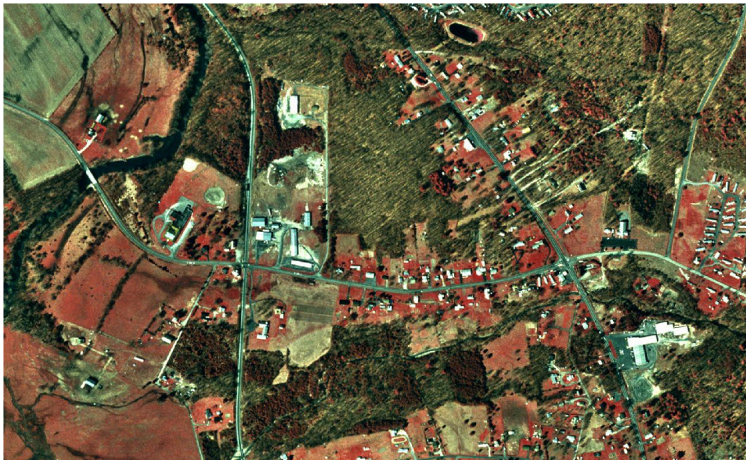
Fig. 2. A 1937 image (top) and a 1994 image (bottom) of the area around Waynesboro, Virginia demonstrating the level of landscape change that can cause problems with automated image-to-image matching and control point identification that are a fundamental process in automated or semi-automated image orthorectification.