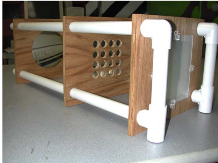
Figure 4. Left: The apparatus to demonstrate a Shack-Hartmann Wavefront sensor. The upper mirror is used merely to reflect a horizontal lightpath into the system. Right: The lens array which forms the heart of the sensor. Each samples a portion of the wavefront, projecting a displaced image on the viewing screen.