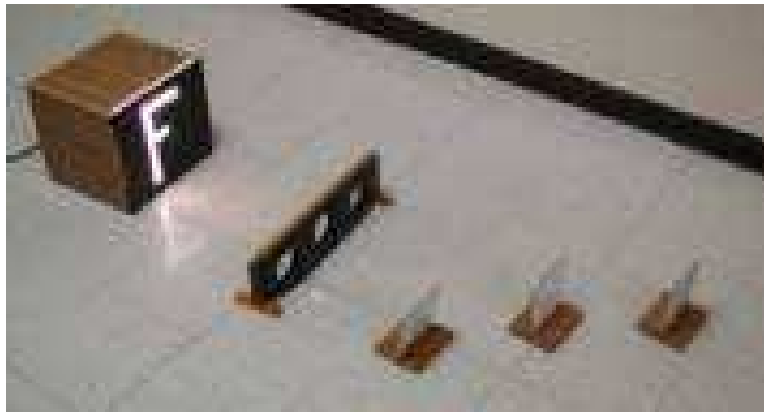
Fig. 1. The basic F-Box setup, showing the light box, lens array, and projection screens.

comparisons of different optical effects easy to observe. A reflective version could be built, as well, though the need to offset the mirrors to throw images onto suitable screens, and the substantial cost of first-surface paraboloids, casts favor in the direction of the refractive version shown here.