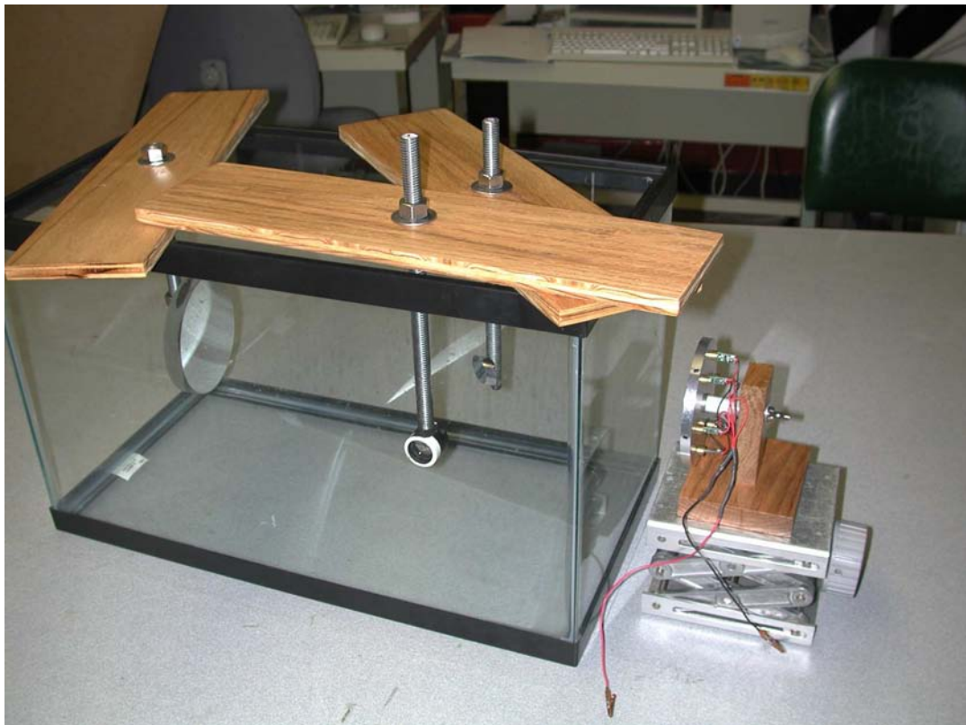
Figure 3. Top: Light path of a Newtonian reflecting telescope, as shown using the Ray Tracing demonstration system. Note that this is not a time exposure; the naked-eye image looks just like (actually better!) than this. Bottom: The setup used to produce the upper image. Note the primary and secondary mirrors, the 'eyepiece', and the laser diode array to the right.