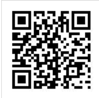
Figure 1. The two-dimensional code of the APP

The APP can be used in the android or OS system. It can be installed very easily. Fig. 1 gives the two-dimensional code of this APP. The student just need to scan the two-dimensional code and the software will set up automatically. Of course, the student also can use it by a computer.