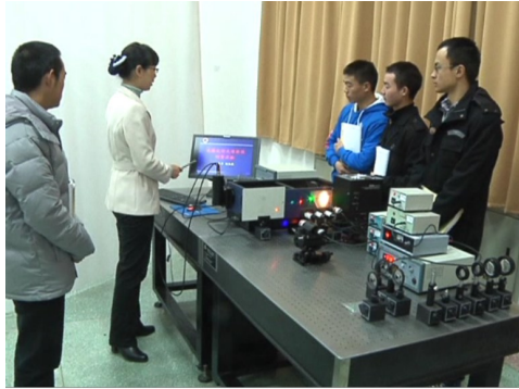
Figure 3. The snapshot of the teaching video